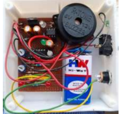
Fig. 1 Buzzer system.

A capacitor is an electronic component that stores electrical charge and energy in an electric field. It is typically made of two conductive plates separated by a dielectric material, which can beair, ceramic, or plastic. The conductive plates are connected to the rest of the circuit via two terminals.Capacitance, measured in farads (F), is a measure of a capacitor's ability to store charge. The capacitance of a capacitor is determined by the size of the conductive plates, the distance between them, and the dielectric material used.Capacitors are commonly used in electronic circuits for a variety of purposes, such as filtering, timing, coupling, and power conditioning.